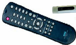
Handheld Remote and Thumb Drive included