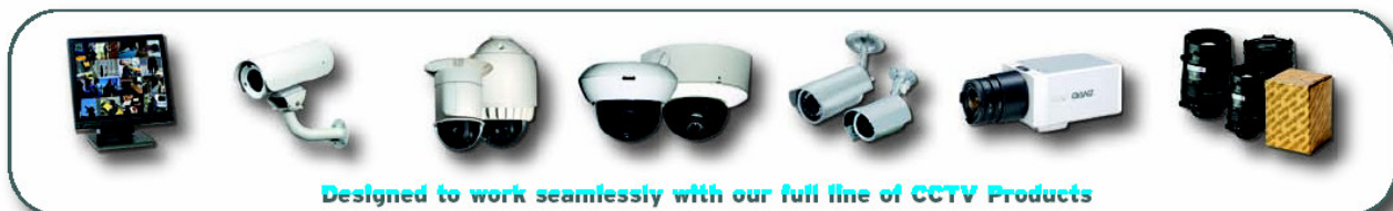
Designed to work seamlessly with our full line of CCTV Products